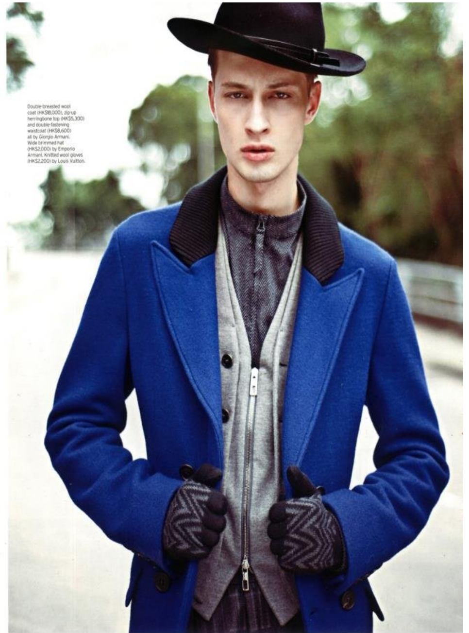
Double-breasted wool coat (HK$8,000), zip-up herringbone top (HK$5,300) and double-breasted vest (HK$6,600) all by Giorgio Armani. Wide brimmed hat (HK$2,000) by Emporio Armani. Knitted wool gloves (HK$2,200) by Louis Vuitton.