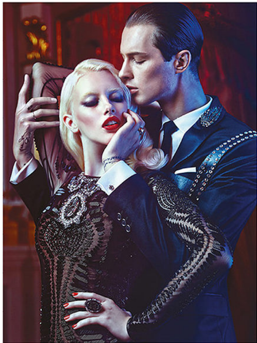
LEFT PHOTO - DISQUARED CLASSIC Tweedo BRIONI shirt and bow tie PINKO belt JIMMY CHOO Slippers JOSÉ ANTA DESIGNS Ring PLATINO socks RIGHT PHOTO - Sofia ZUHARIR MURAD Tulle dress with embroidered and beaded collar SWAROVSKI Necklace, brooch and ring Dress JUST CAVALLI jacket with embroidered collar FERMINI GILDO ZIGNA shirt DIOR HERBAME Tie ASSAAD AKHAD Hatena with crystal JOSÉ ANTA DESIGNS Ring