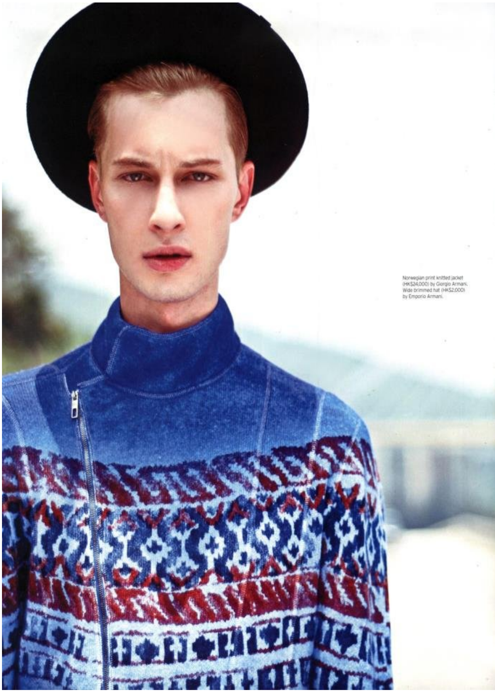
Norwegian print knitted jacket (HK$4,000) by Giorgio Armani. Wide brimmed hat (HK$2,000) by Emporio Armani.